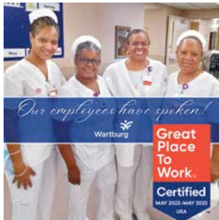
Wartburg Certified Great Place to Work by the Great Place to Work Institute and Its Senior Care Partner Activated Insights