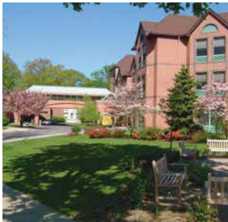
Wartburg Nursing Home Earns Top Rating by the 2021 New York State Nursing Home Quality Initiative [NHQI]