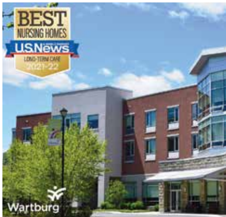
Wartburg Named Among Best Nursing Homes in New York for 7th Consecutive Year by U.S. News and World Report