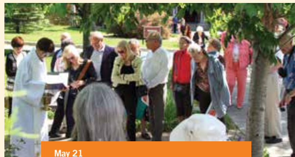
May 21 Service of Prayer and Remembrance – A Celebration of Life and Blessing of Legacy Gifts