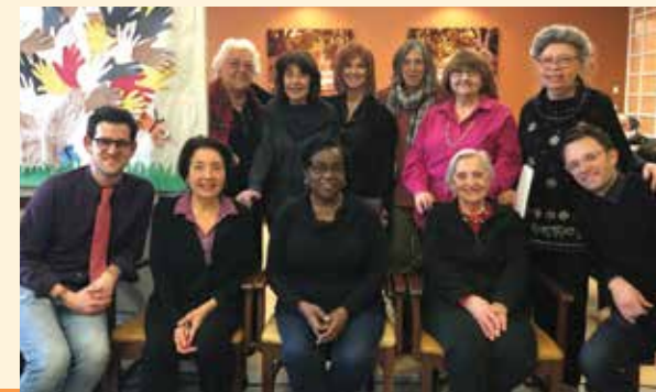
December 19 Adult Day Services Improv Show