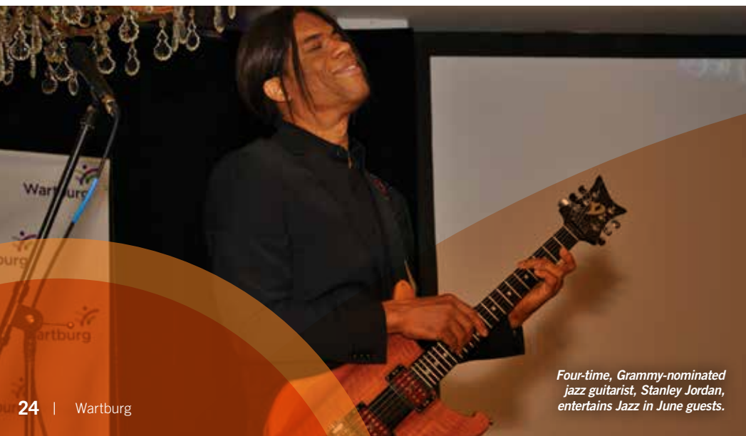
Four-time, Grammy-nominated jazz guitarist, Stanley Jordan, entertains Jazz in June guests.

Proceeds from the 2017 Jazz in June gala helped Wartburg purchase an indoor Smart Car for its Rehabilitation Center and helped support Wartburg's internationally recognized, award-winning Creative Aging & Lifelong Learning initiative by hiring a Creative Arts Therapist who will provide classes that offer Wartburg residents stimulating arts-based programs such as dance therapy. The Smart Car, installed in 2018, allows patients the opportunity to comfortably re-adapt to transferring in and out of a motor vehicle, a necessity for achieving independence.