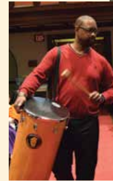
December 9 Creative Aging Winter/Spring Concerts