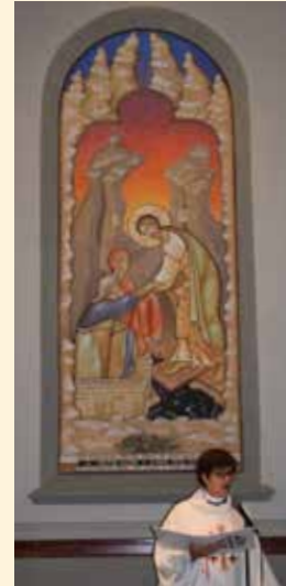
November 5 Chapel Icon Dedication