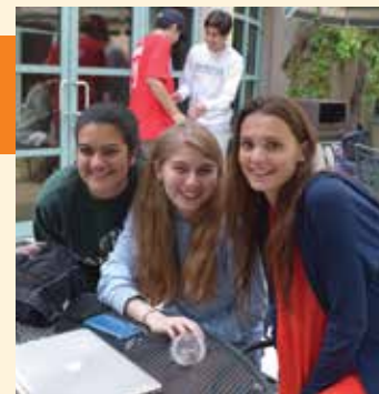
May 23 Bronxville High School Service Day