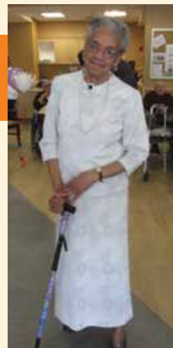
May 12 Adult Day Services Mother's Day Fashion Show