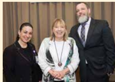
May 11 Essentials of Estate Planning Seminar