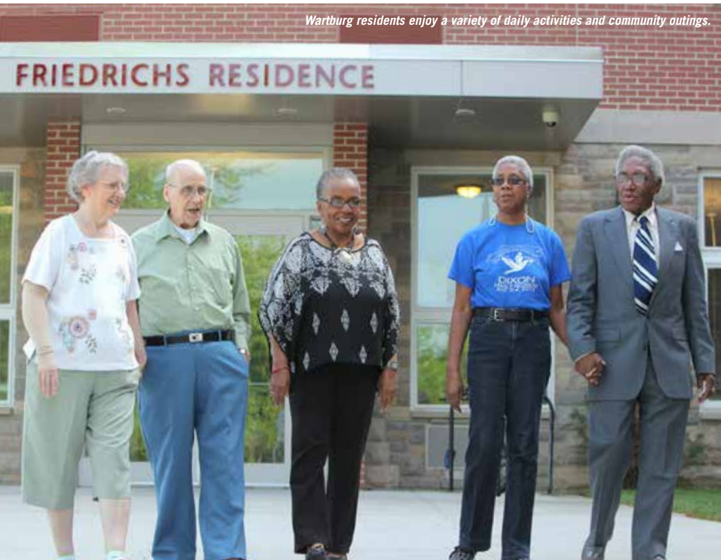
Wartburg residents enjoy a variety of daily activities and community outings.

Living independently at Wartburg offers the comforts of a retirement community on a rental basis, in a secure gated, community. There are no entrance fees or long-term commitments. Comforts include;