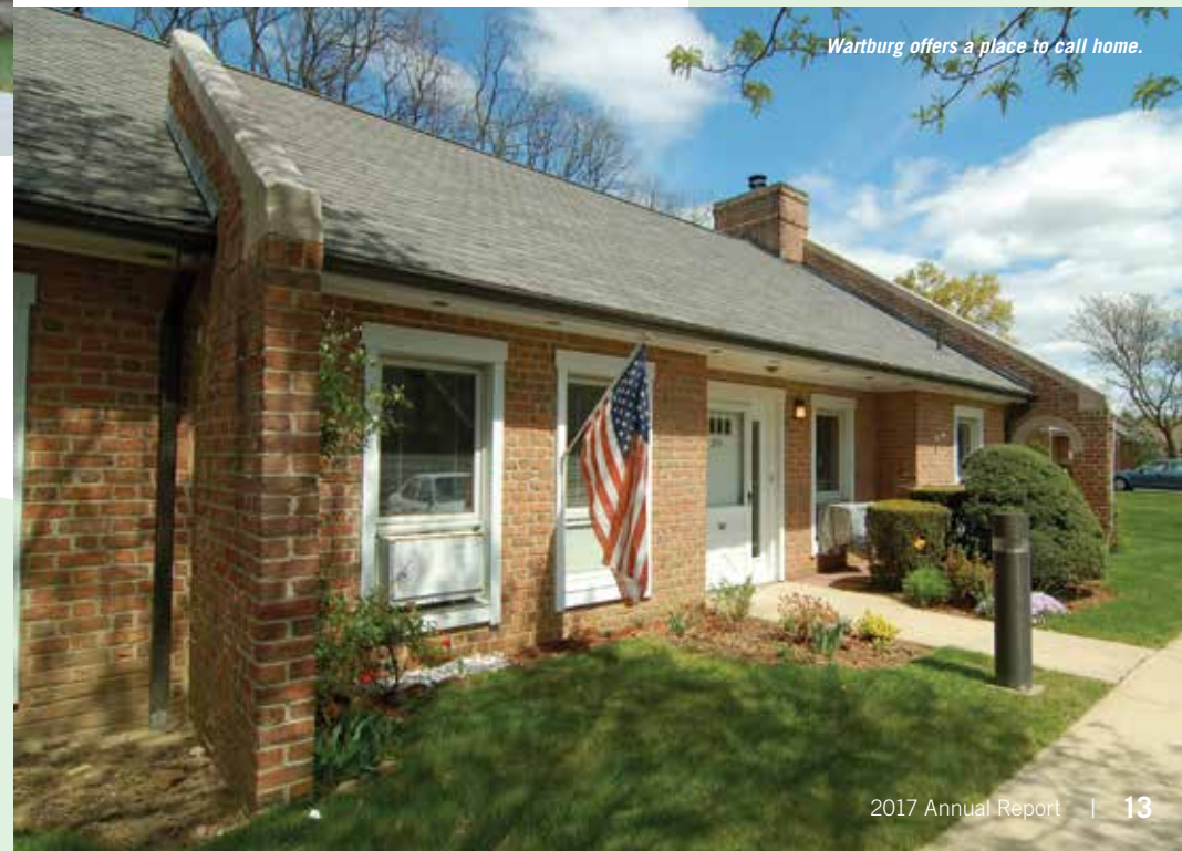
Wartburg offers a place to call home.

Vice President of Residential and Home Care Services and Wartburg staff member for over 14 years.