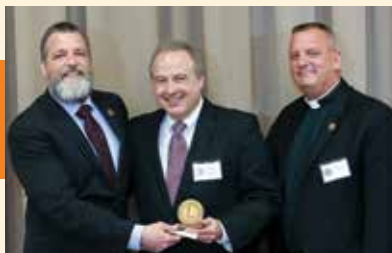
April 19 Passavant Society Luncheon