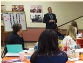
April 25 LeadingAge New York IGNITE Leadership Academy