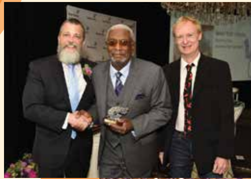
June 15 Jazz in June Gala