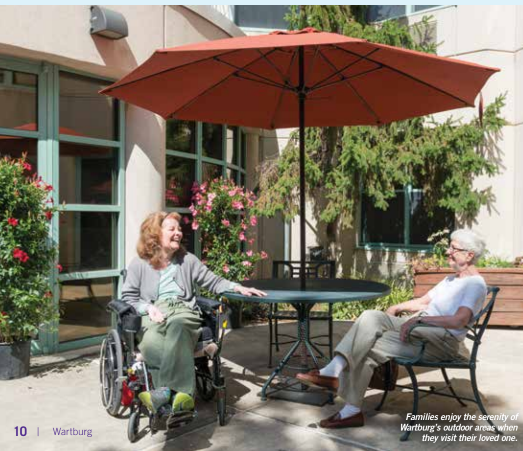
Families enjoy the serenity of Wartburg's outdoor areas when they visit their loved one.